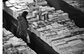
a book sale