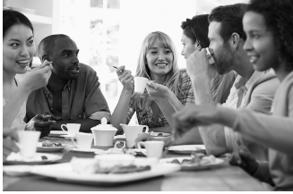
an international party