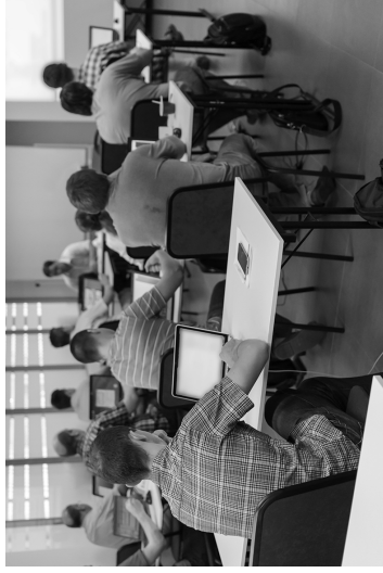
a computer class