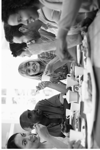
an international party