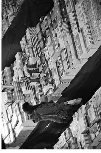
a book sale